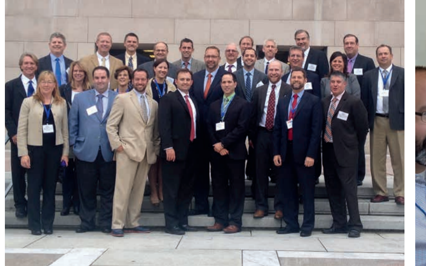
ACEC's Senior Executive Institute (SEI) Class XXI on Capitol Hill.