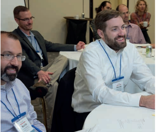
ACEC's Pathways to Executive Leadership program.

"In engineering school, you don't learn about business, about public policy, about communication—or about marketing or strategic planning. All of these are necessary to run an effective business, and ACEC provides excellent, cost-effective training in these areas."