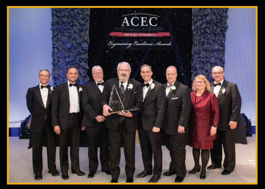
HDR and WSP USA were awarded the 2018 Grand Conceptor Award for their project "Bayonne Bridge: Raising the Roadway".

ACEC's prestigious Engineering Excellence Awards recognize the best engineering projects of the year. Known as the "Academy Awards of the engineering industry," the annual black-tie event attracts industry leaders, Members of Congress and Administration officials.