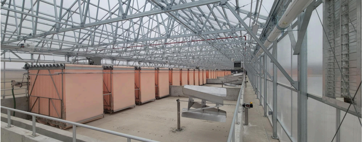
City of Slater Waterworks Plant- Snyder

MARRIOTT- WEST DES MOINES MAY 14-15, 2025