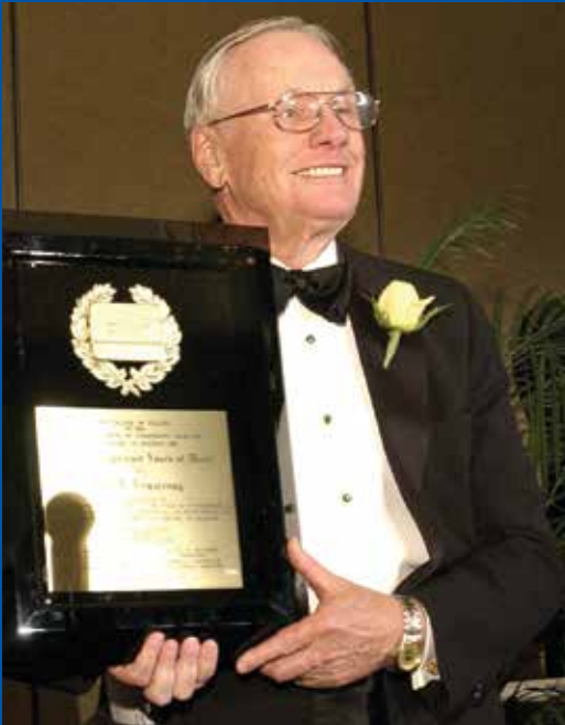
Neil Armstrong receives ACEC's Distinguished Award of Merit.