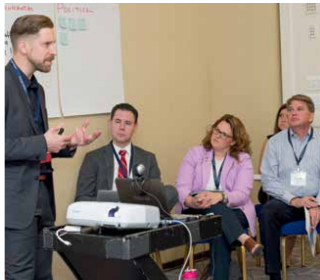
ACEC's Emerging Leaders Forum and Pathways to Executive Leadership Program.

“In engineering school, you don’t learn about business, about public policy, about communication—or about marketing or strategic planning. All of these are necessary to run an effective business, and ACEC provides excellent, cost-effective training in these areas.”