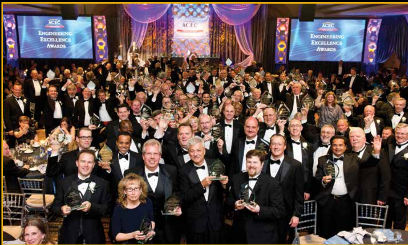
2013 Engineering Excellence Awards National Recognition Award Winners Celebrate at the Awards Gala in Washington, DC.