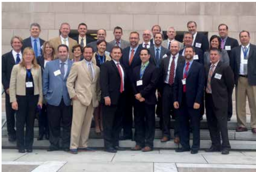
ACEC's Senior Executive Institute (SEI) Class XXI on Capitol Hill.